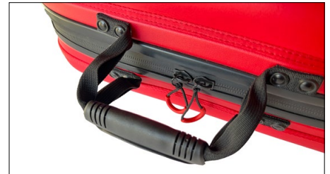
Heavy-duty zip with glove-friendly pulls