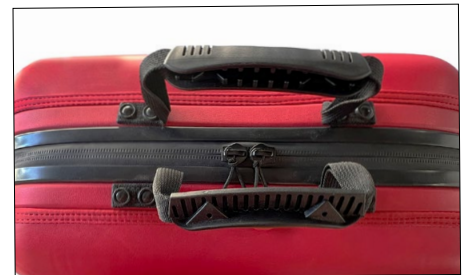
Interlocking rubberised handles for easy carrying