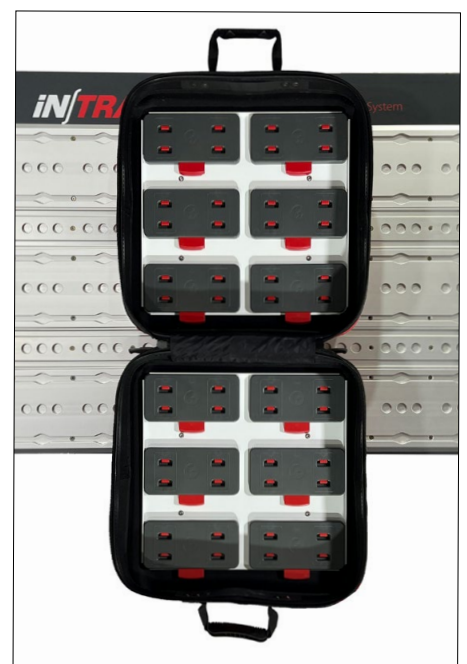
Configure iNCASE with your preferred SafePouch layout