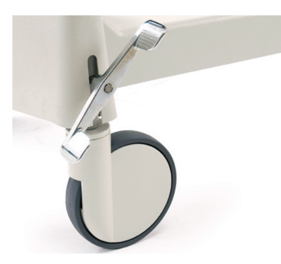
Four 8" Swivel Wheels lock instantly with a single foot pedal or one set of wheels directionally locks for easy rolling.