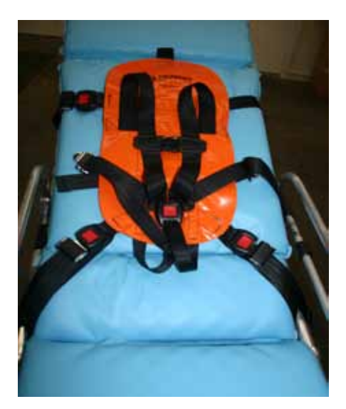
Fig 6: Pedi-Mate securely in place