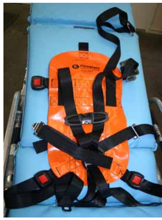
Fig 1: Pedi-Mate positioned on a cot, ready for securing