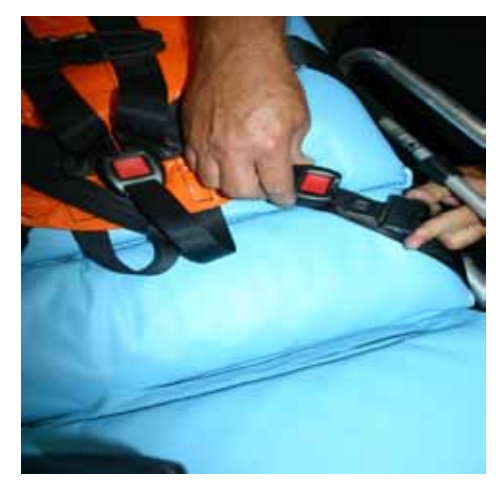
Fig 4: Lower non patient strap to a Ferno cot

5. Align the two lower non patient straps with the base of the cot backrest. Feed the two buckles around the both main frames and connect to the clasp and tighten/adjust accordingly. NOTE: Ensure the straps for the harness mount points are not twisted & the Pedi-Mate is centrally positioned. (Figures 4 and 5)