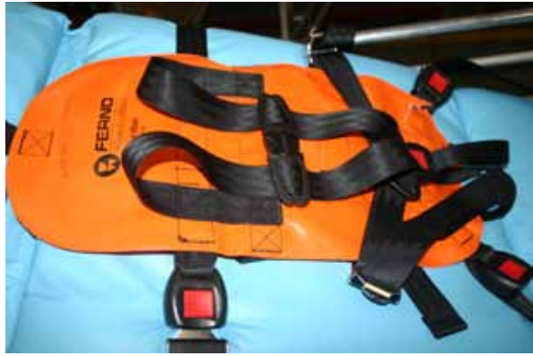
Fig 3: Upper non patient strap tightened