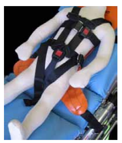
Fig 9: Chest strap fitted

To loosen the patient straps, grasp the adjustment tabs with one hand and pull the strap back through the tab with your other hand.