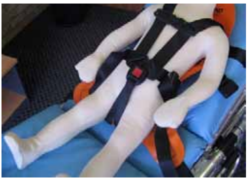
Fig 8: Shoulder and crotch strap fitted