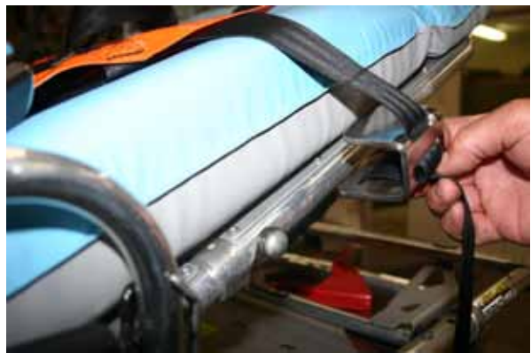
Fig 2: Position the U bracket onto the side of the backrest frame