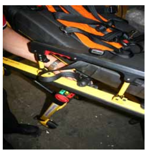
Fig 5: Lower non patient strap to a Stryker cot

6. Ensure Pedi-Mate is centrally positioned and securely in place. Undo and lengthen all patient straps, buckles and restraints so the Pedi-Mate is ready for patient. (Figure 6)