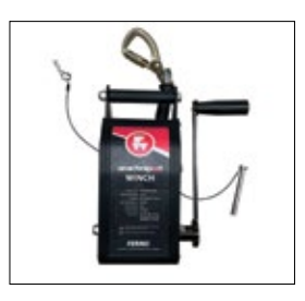
Winch (APOD-WINCH20M) Requires APOD-FBA sold separately or together in a kit (APOD-WINCH20K)