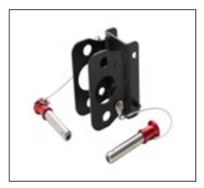
Fall Arrest Block Adaptor (APOD-FBA)