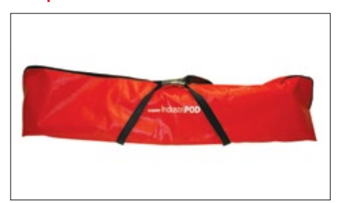
IndustriPOD® Bag (36-1019)