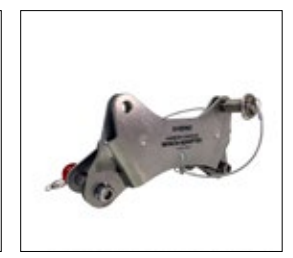
Harken Lokhead Winch Bracket (APOD-HWAB)