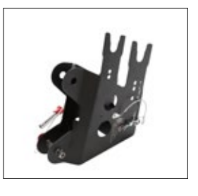
IK Fall Arrest Adaptor (90-0449)