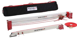
Bridge Kit (APOD-BR*)

Includes the versatile Lazy Leg plus the components to convert it to a Standard Leg, or to form an A-Frame with Lazy Leg. This kit pairs well with the Standard Tripod to expand capabilities for more complex scenarios. Sold separately.