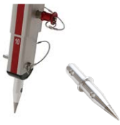
Spike Foot (90-0120)

Expansion kits are pre-assembled components designed to expand the capabilities of your Arachnipod.