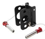
Fall Arrest Block Adaptor

Supplied with a bracket which mounts to the middle section of any supporting leg. 15m length. WLL 136kg / 300lb Sold separately.