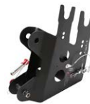
I.K. Fall Arrest Block Adaptor

This adaptor enables SALA Type 3 fall arrest blocks, Pelsue winches and other similar-shaped blocks to be attached to an Arachnipod leg. Sold separately.