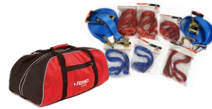
Bridge Ratchet Kit (APOD-BRS)

The Bridge Kit includes a bridge beam with trolley (2m, 3m or 4m length), a standard leg, foot tether and rope grab plus storage bag. This kit is used to upgrade the functions of an Arachnipod tripod to a bridge system. Sold separately.