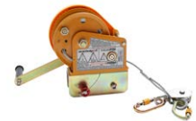
Winch with Cable (APOD-W*)

Included in the Full Accessory Kit, or sold separately.