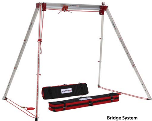
Bridge System (bridge beams in 2m, 3m or 4m lengths)