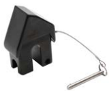
Lazy Leg Adaptor (APOD-LLA)

Included in the Advantage and Full Accessory Kits, or sold separately.