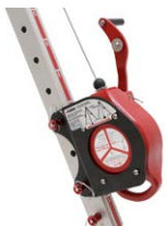
Type 3 Fall Arrest Block

Type 2 winch with mount bracket and basic wind up/down mechanism. 6mm galvanised steel cable. 10m, 20m, 25m. WLL 220kg. Sold separately.