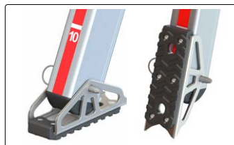
Standard Foot 2 (90-0472) Dual function for smooth or rocky surfaces

Arachnipod models are shown with the original Standard Foot but will be supplied with the new dual-function Standard Foot 2 from 24 August 2020.